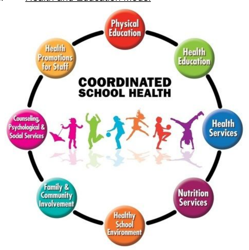
Creating a Healthy School Environment, Chatham County, North Carolina